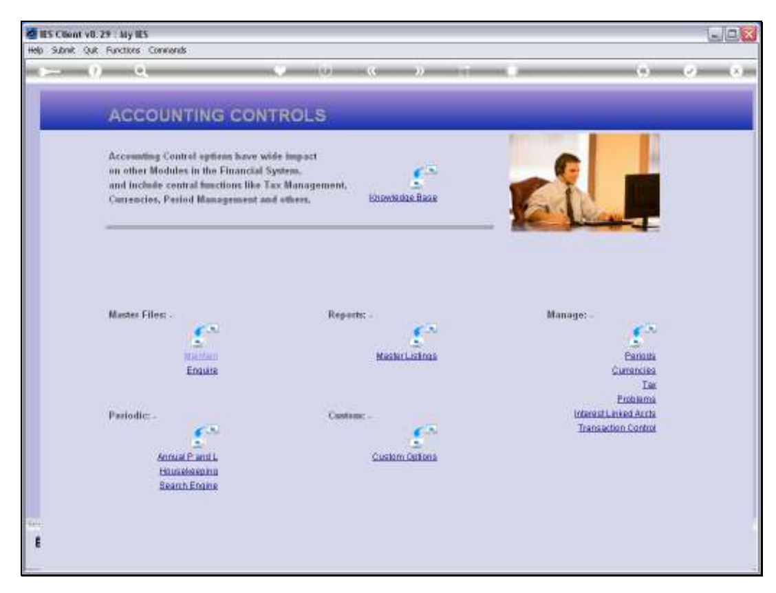
Slide 1 Slide notes: At Reports in Accounting Controls, we have an option to list the Transaction Types used with Financial Transactions.