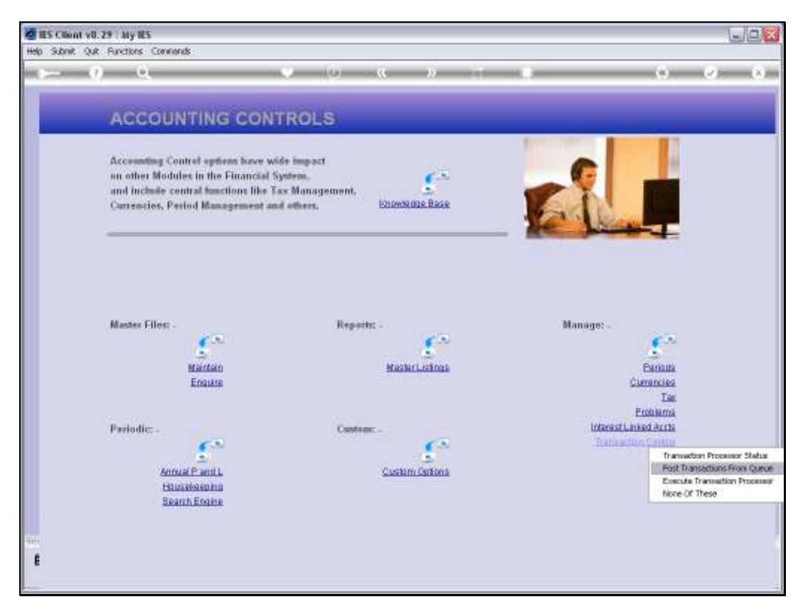
Slide 3 Slide notes: We have an option to post, on demand, Transactions that are waiting in the Transaction Queue.