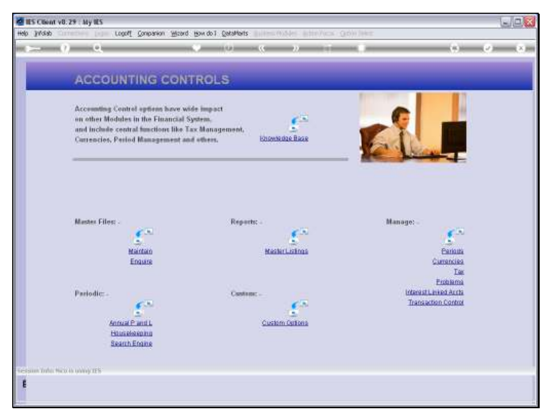
Slide 5 Slide notes: