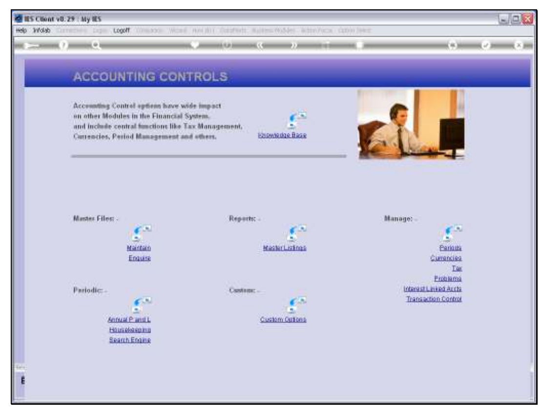
Slide 1 Slide notes: From the Interest Linked menu, we have a Report option for the Interest Group objects.