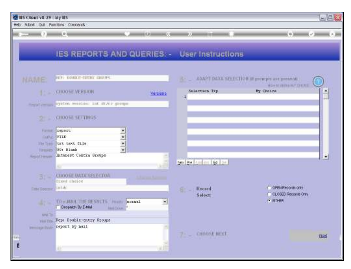
Slide 4 Slide notes: