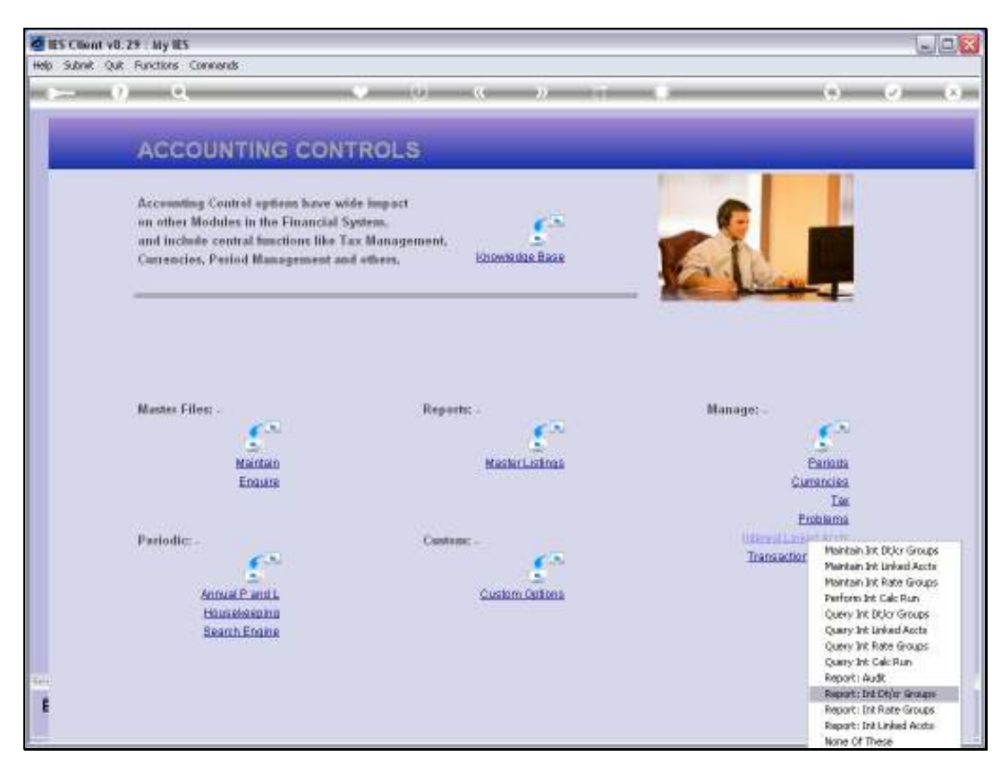
Slide 3 Slide notes: