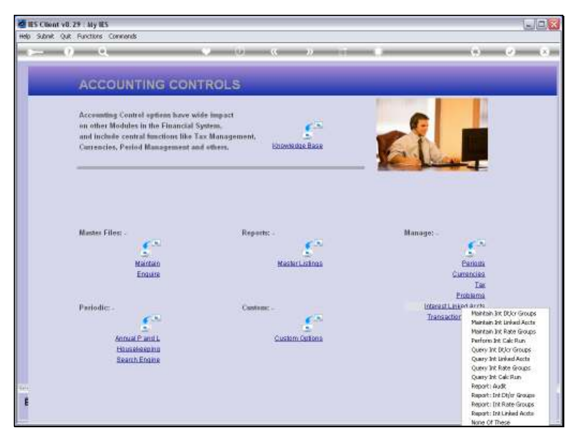
Slide 2 Slide notes: