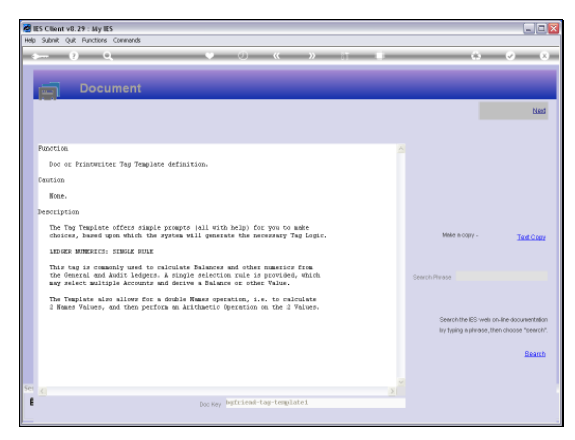
Slide 3 Slide notes: