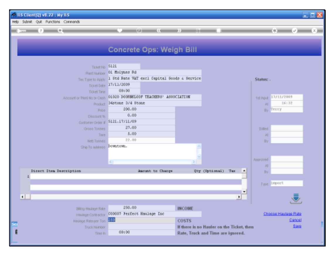
Slide 3 Slide notes: The Haulage Costs are processed only IF a Haulage Rate per Ton is listed, AND a Haulage Contractor is indicated.