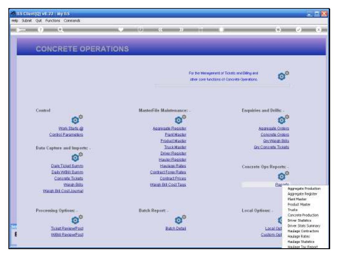
Slide 5 Slide notes: