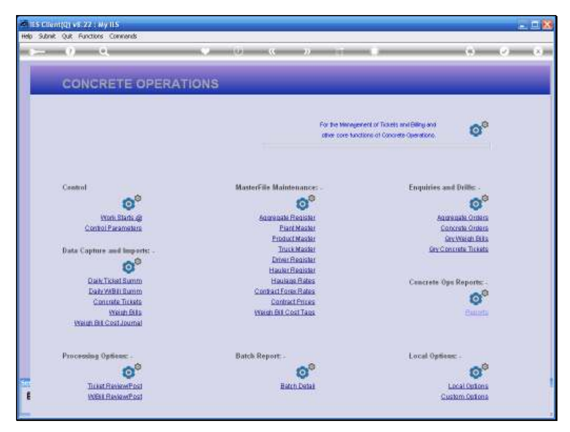
Slide 7 Slide notes: