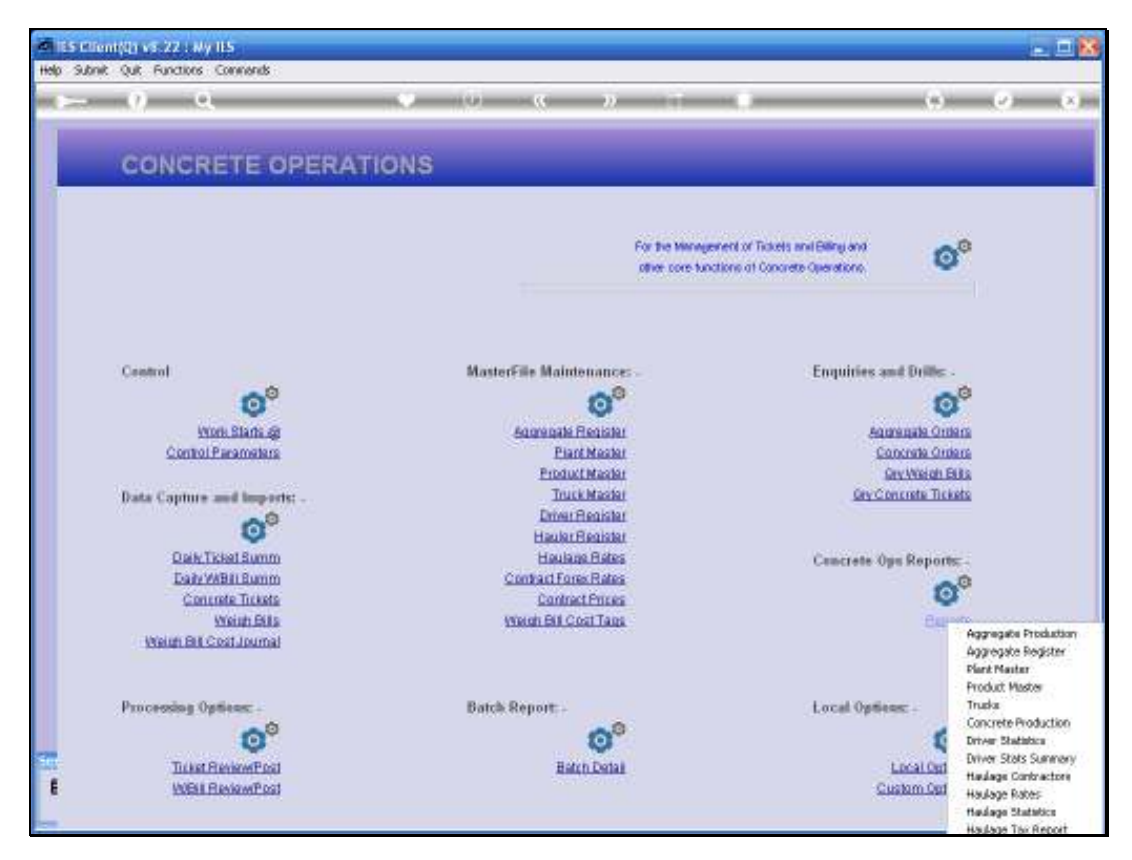
Slide 6 Slide notes: