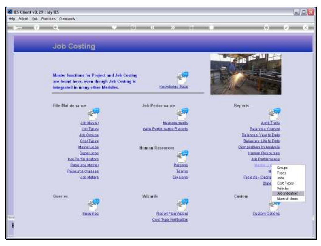
Slide 13 Slide notes: