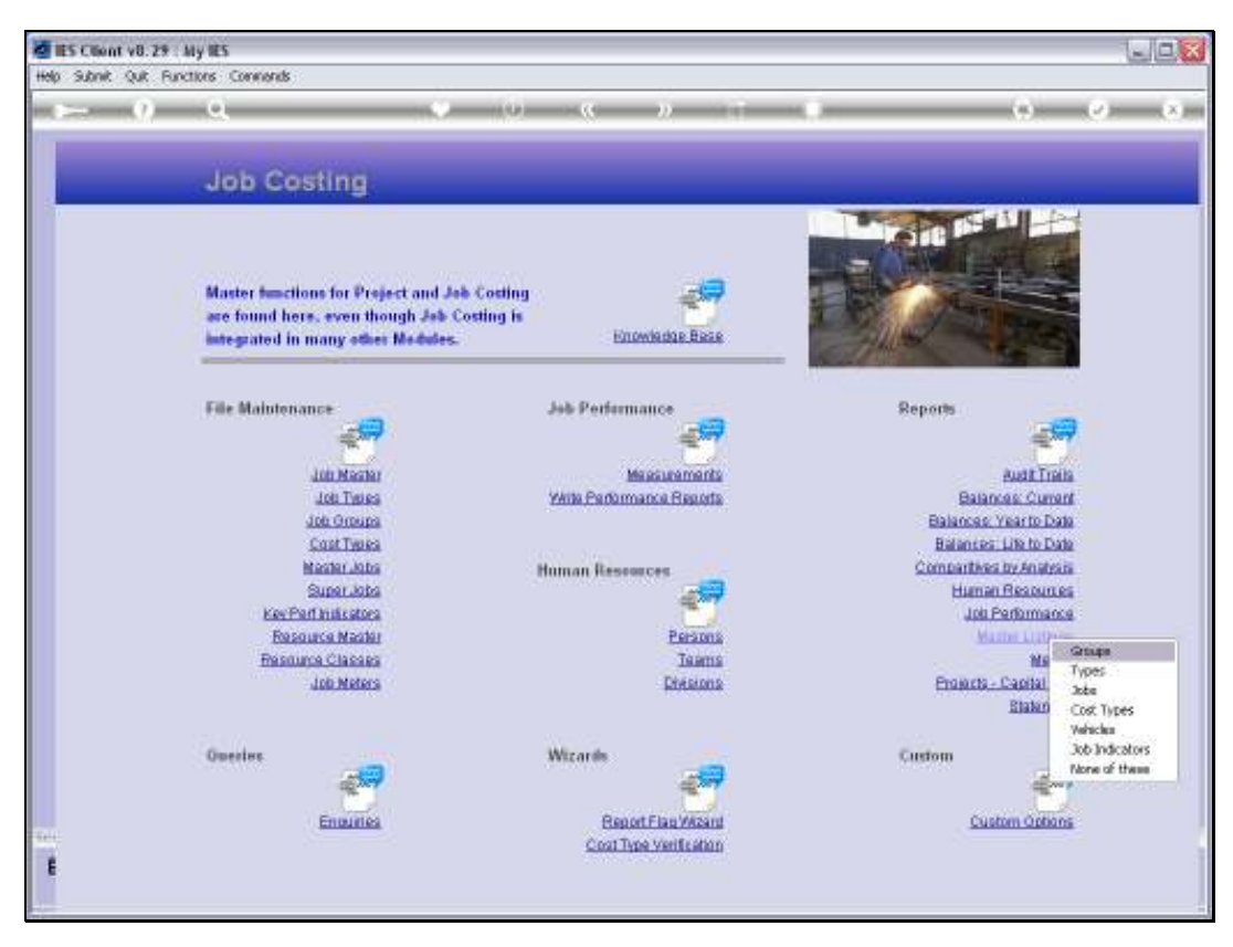
Slide 3 Slide notes: