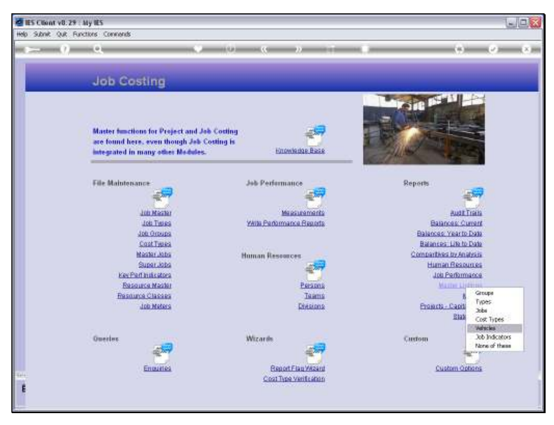
Slide 11 Slide notes: