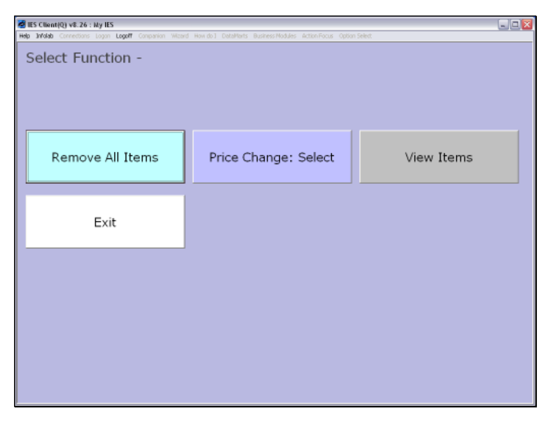
Slide 3 Slide notes: