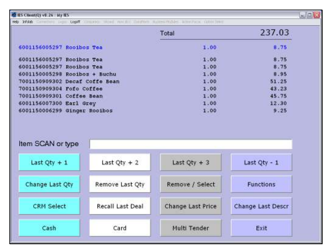
Slide 2 Slide notes: When we need to see all Items on the list, we can use the 'view' function.