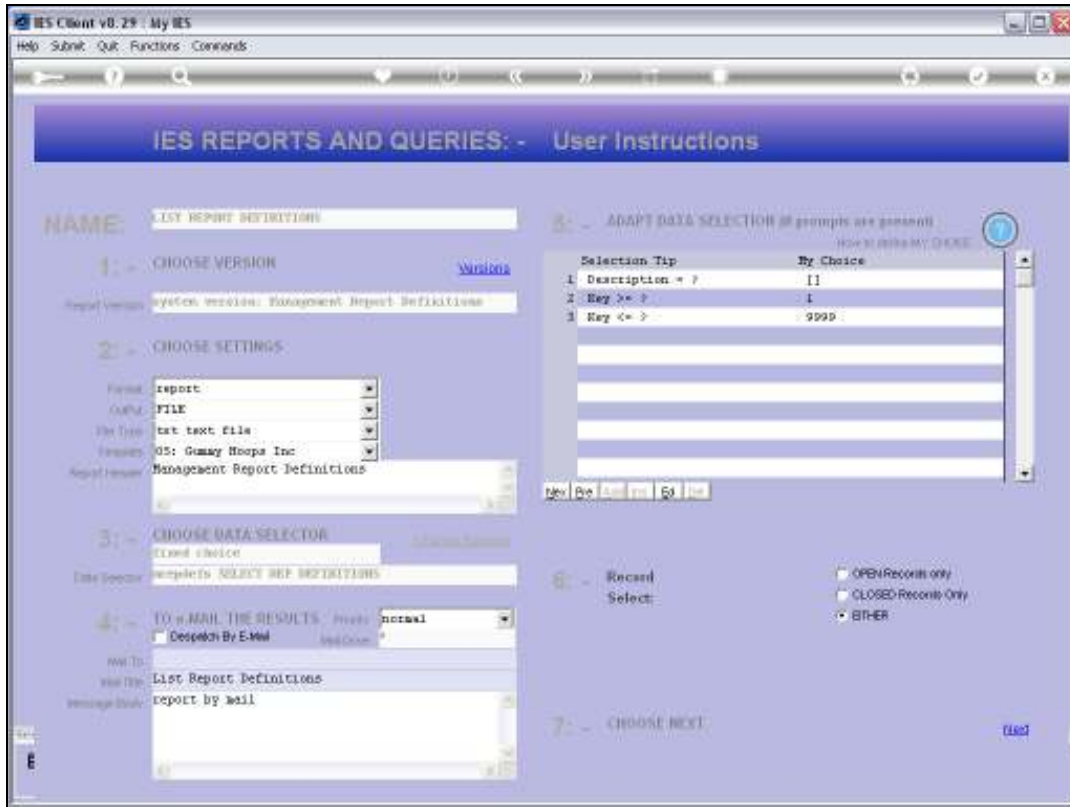
Slide 3 Slide notes: